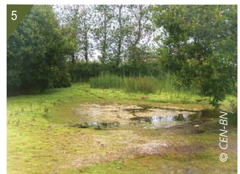
3. The side channel colonised by New Zealand pigmyweed.