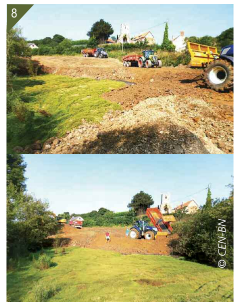
6. Diagram showing the work on the site.