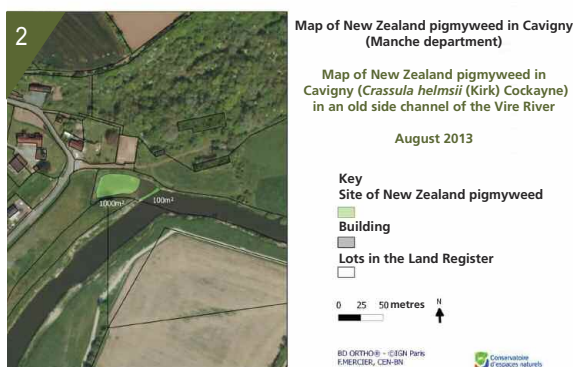
1. Map showing the distribution of New Zealand pigmyweed in the Basse-Normandie region and the intervention site. 2. Map showing the area colonised by New Zealand pigmyweed in an old side channel of the Vire River.