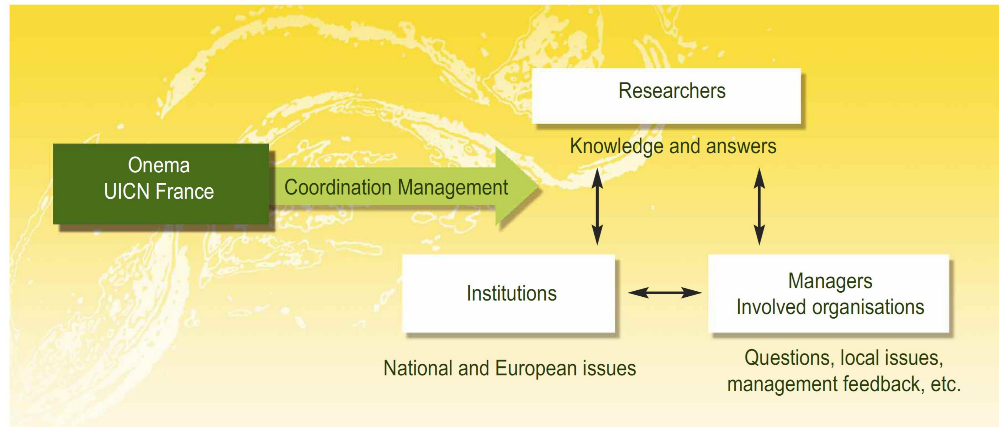
Organisation of the Biological invasions in aquatic environments work group (IBMA)