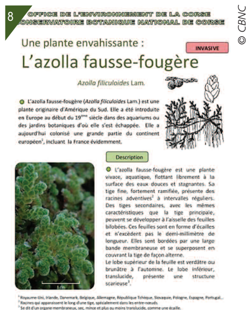
8. First page of the informative document on water fern.