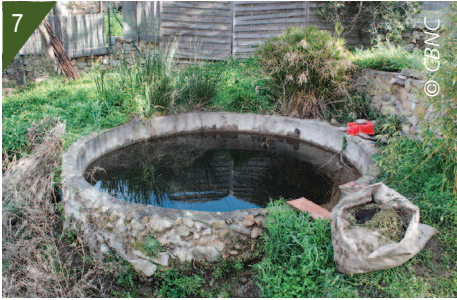
7. The pool in Lumiu following the work.