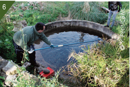
5. Setting up the mosquito net for the pool in Lumiu. 6. Collecting fragments of water fern with a dip net.