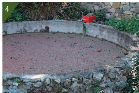
3. Colonisation of the Réginu River by Azolla filiculoides .