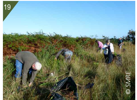
19. Manual uprooting by volunteers.