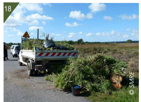
15. Groundsel bushes sprouting after uprooting. 16. 17. Uprooting of groundsel bushes using the telescopic tripod and chain hoist. 18. Removal of the waste to an incineration unit using a dump truck.