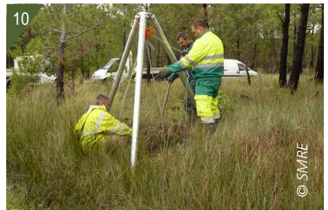
7. Metal plates used to protect the salt meadow when machines are used to mechanically uproot the bushes.