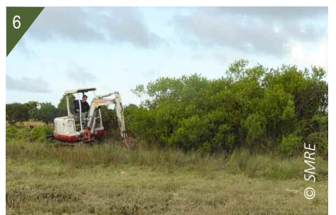
2. Salt meadows colonised by groundsel bushes. 3. Volunteers during uprooting work. 4. 5. Grazing by sheep. 6. Mechanical uprooting.