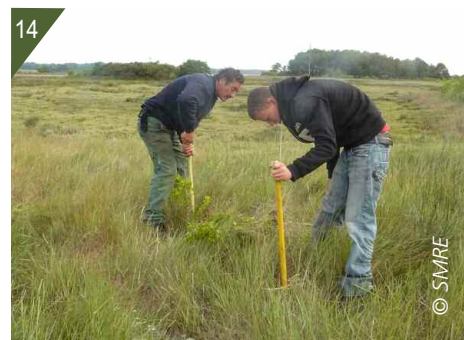
11. Manual uprooting using the "baccharache" tool.