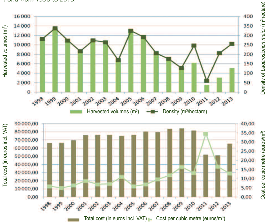
Total cost and cost per cubic metre of work to manage Lagarosiphon major in the Blanc Pond from 1998 to 2013.