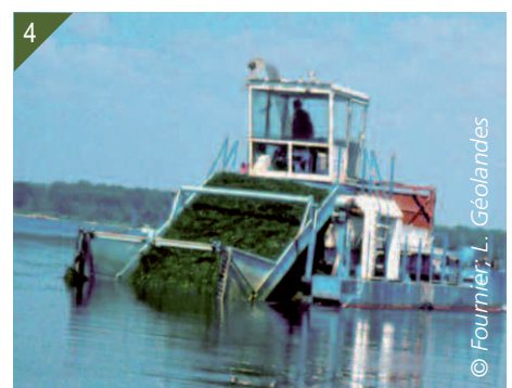
2. Blanc Pond colonised by Lagarosiphon major . 3. Potential harvesting zones. 4. Harvester boat.