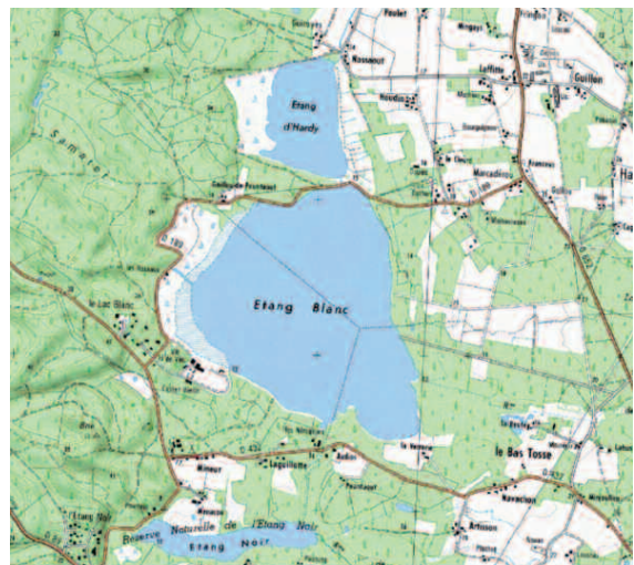
1. The Blanc Pond.